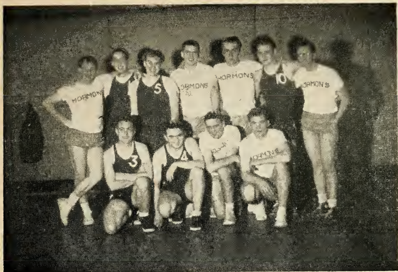
The Elders of the Bristol District met Bristol University basketball team in a match on November 26th and were victorious by a score of 62-56. Bristol University is the acknowledged champion of the Southern Division of the University League.